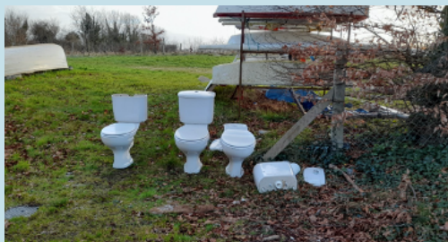
This may look like part of our Covid 19 plan for social distancing, but never fear. These are in fact the replaced toilets from the horseboxes.

We have 6 new waste bins – 3 for domestic (general) waste and 3 for recycling (these are slightly larger than your home bin). The remaining old bins are for GLASS only. It is intended that skips will only now be used for the junior course and regatta.