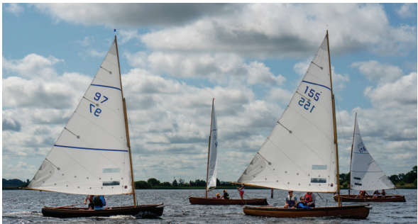
Shannon One Designs racing in front of the club during the Breen Weekend