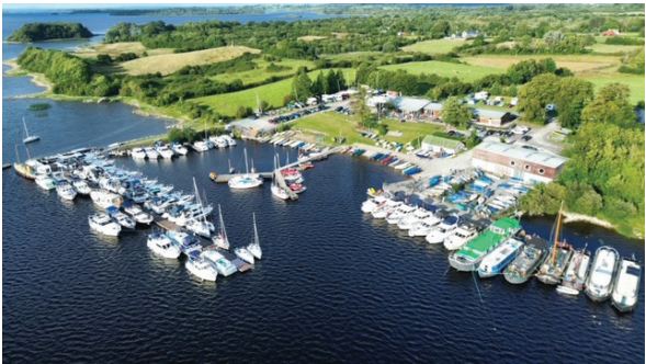
Aerial view of the Club during the Annual Regatta in 2024.

Available as part of the winter training programme only.