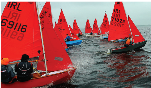
Mirror Fleet start during Double Ree 2024.